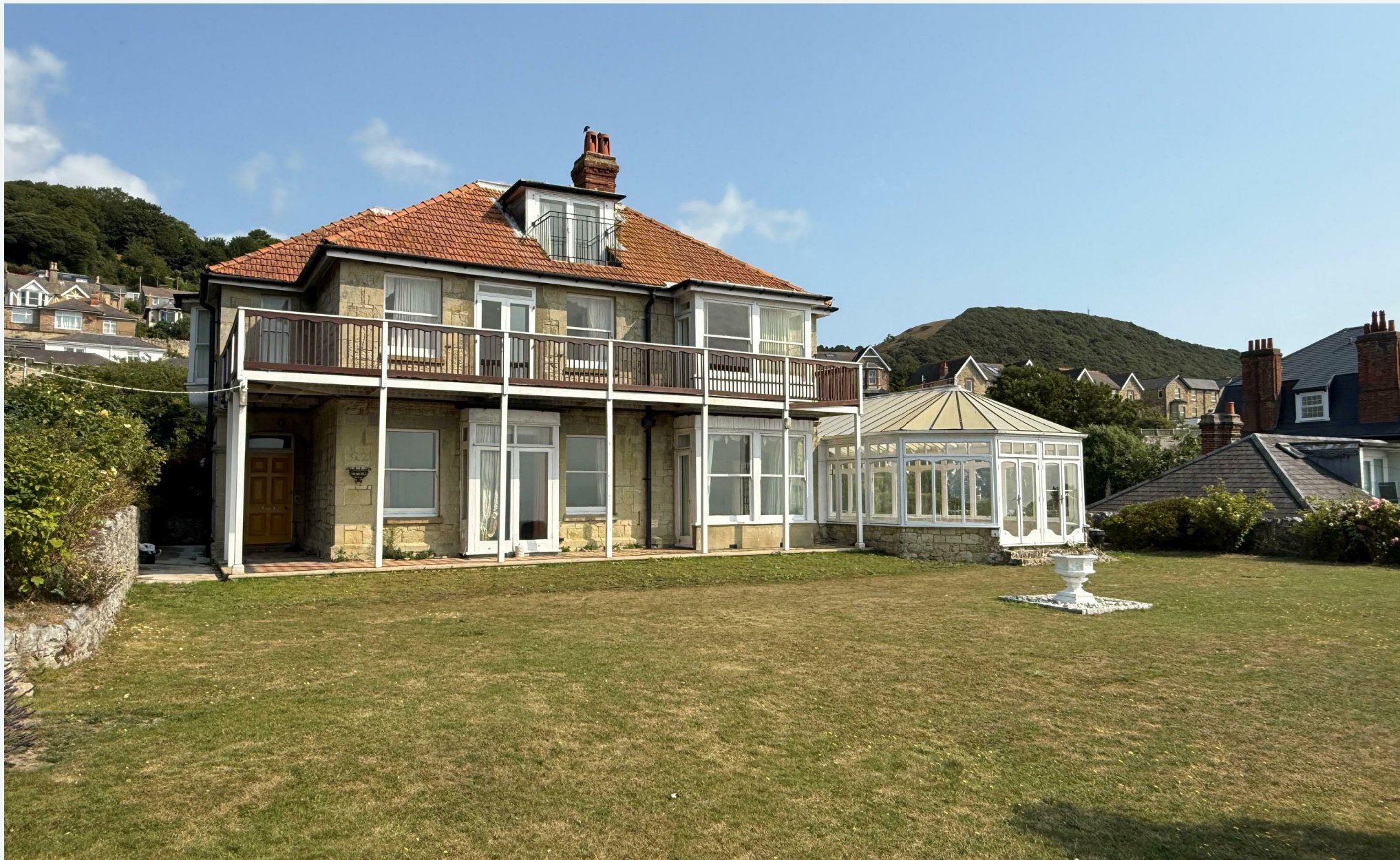
Trewartha, Belgrave Road, Ventnor, Isle of Wight